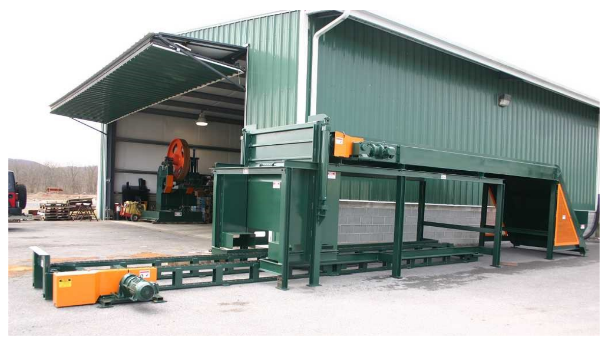
Systems are fully assembled and tested at our factory prior to shipping.